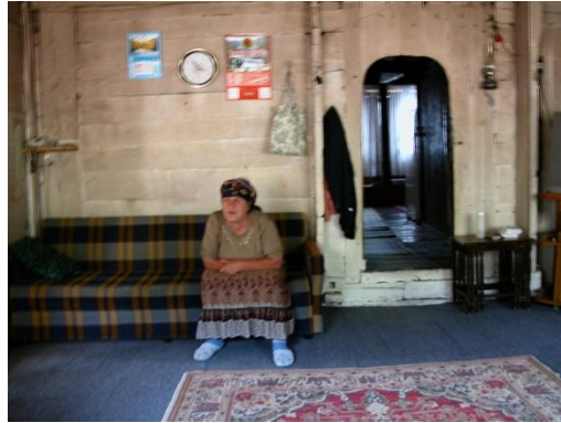
oTurma sal oni

konstruqciul i struqturis Tval sazrisiT did interess iwvevs sacxovrisSi buxris mowyobis tradicia.