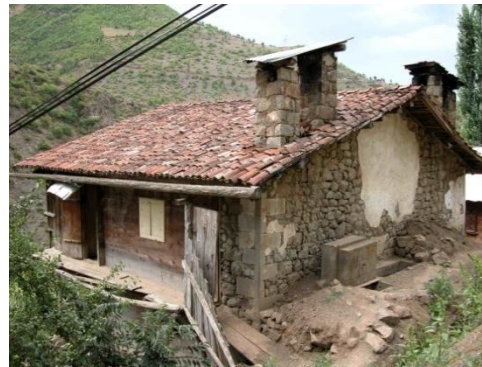
sacxovrebel i saxl i sof. berTaSi

svirevanisaTvis tradiciul i karmidamos tipi dResacaa SenarCunebul i, yovel SemTxvevaSi kargadaa dacul i kar-midamos mowyobis ZiriTadi safuZvl ebi. dakvirvebul i Tval i SeniSnavs kar-midamos struqturis umniSvnel o cvl il ebebsac. SevqeT yaral oRI is kar-midamos garkveul i mosazrebiT, SeiZl eba vuwodoT tipiuri, kl asikuri imerxeul i kar-midamo, roml is teritoriaze aSenebul i sacxovrebel i xiT xuroobis teqniki maRal doneze metyvel ebs.