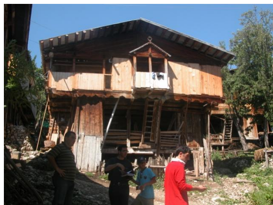
sacxovrebel i saxl ebi (bazgireTi)