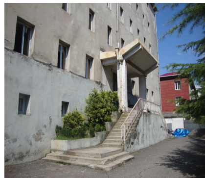
საარქივო სამმართველო სარემონტო სამუშაოების დაწყებამდე

2011 წ. ოქტომბერ-დეკემბერში ამ შენობას ჩაურატდა სარემონტო სამუშაოები, ფაქტიურად მწყობრში ჩადგა ახალ შენობა. საარქივო სამმართველო აღიჭურვა თანამედროვე საოფისე ავეჯით და კომპიუტერული ტექნიკით: