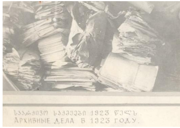
ქალაქის საბჭოს სარდაფში აღმოჩენილი დოკუმენტების გროვა 1921 და 1923 წწ.