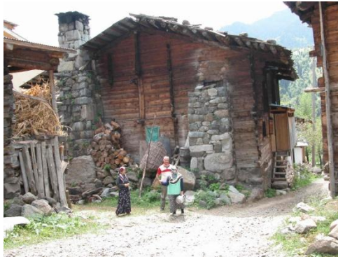
orbuxriani saxl i sof ifxrevel Si (imerxevi)