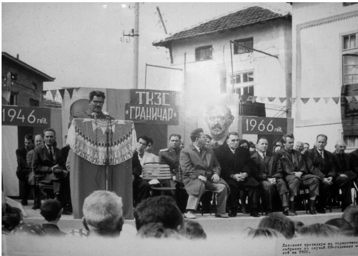
Celebration of the 20 anniversary

Ten years later after the introduction of the Law for total mass cooperation of land (1957) all the land was cooperated. The cooperation led to the mass emigration of the villagers to the towns. Nevertheless after 1990 the land was given back to the people in their original location this measure did not change the former situation. The depopulation of the village continues today, only 25 old people live in the village at present, the bigger part of the land is not cultivated, and the village is doomed to gradually dying. This is the destiny of the all Bulgarian villages in the region.