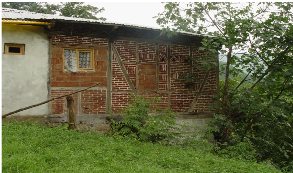
sacxovrebel i saxl i murRul is raionSi

sicocxl is xe. rogorc Cans, ornamentebs sacxovrebel i nagebobebis konstrukciaSi aqac gansakuTrebul i adgili uWiravs da Sesabamisad garkveul i funqciis matarebel ia.