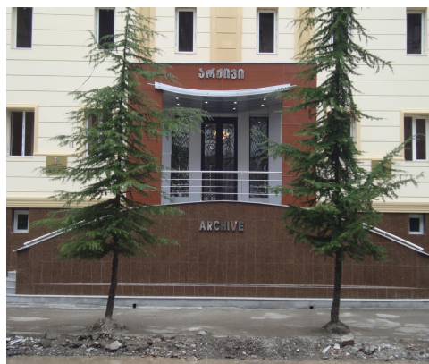
საარქივო სამმართველო სარემონტო სამუშაოების დასრულების შემდეგ

შეკეთდა და კეთილმოეწყო სამუშაო ოთახები, კანცელარია და სამკითხველო დარბაზი: