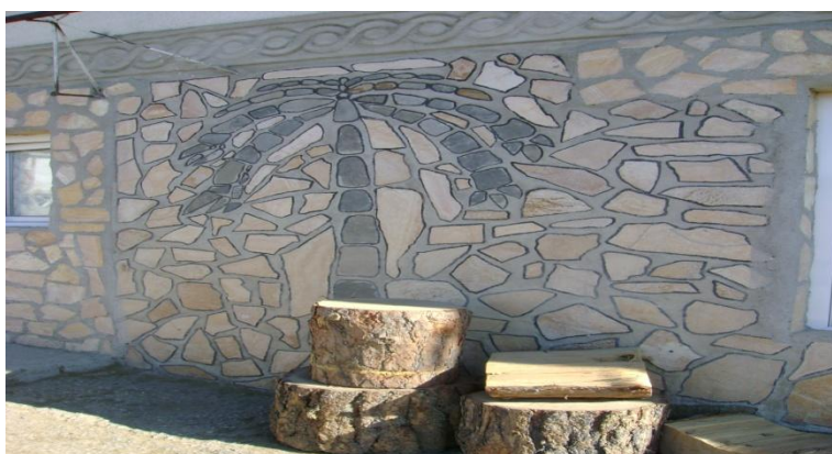
sacxovrebel i saxl is fasadi sof. ribnovoSi (bul gareTi)

Aam tipis ornamentSi vazTan erTad figurirebs sxva mcenareebic. Mmag. musul mani bul garel ebis sofel ribnovoSi davafiqsireT sacxovrebel i, roml is kedel ze pal maa gamosaxul i.